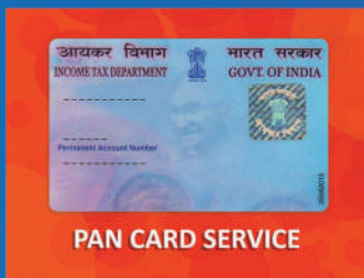
PAN CARD SERVICE